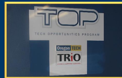
Tech Opportunities Program

Serves the Oregon Tech community for all testing needs with trained student proctors as well as providing a secure, quiet testing center. Services include; make- up testing, early-take testing, Reduced Distraction rooms, and secure online testing.