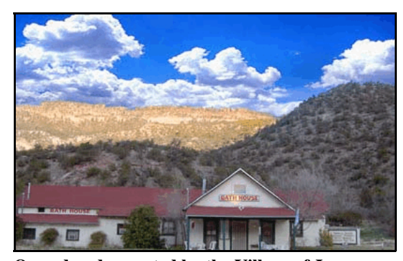
Owned and operated by the Village of Jemez Springs, the Jemez Springs Bath House is open seven days a week.

AmeriCulture has plans to expand. It is working on a binary geothermal power plant design that, once built, would create 160 additional jobs in an onsite production and processing facility.