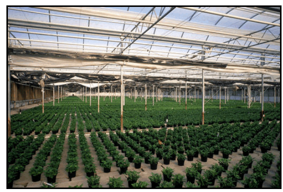
The Masson Radium Springs Farm geothermal greenhouses are located on private land in southern New Mexico.

Burgett Greenhouse's annual cost savings by using geothermal heat compared to natural gas is about $1.8 million.