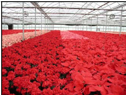
The Milgro Nurseries greenhouse near Newcastle

The Blundell Geothermal Power Plant and numerous geothermal small businesses across the state employ more than 350 Utahans. Using a multiplier of 2.5,