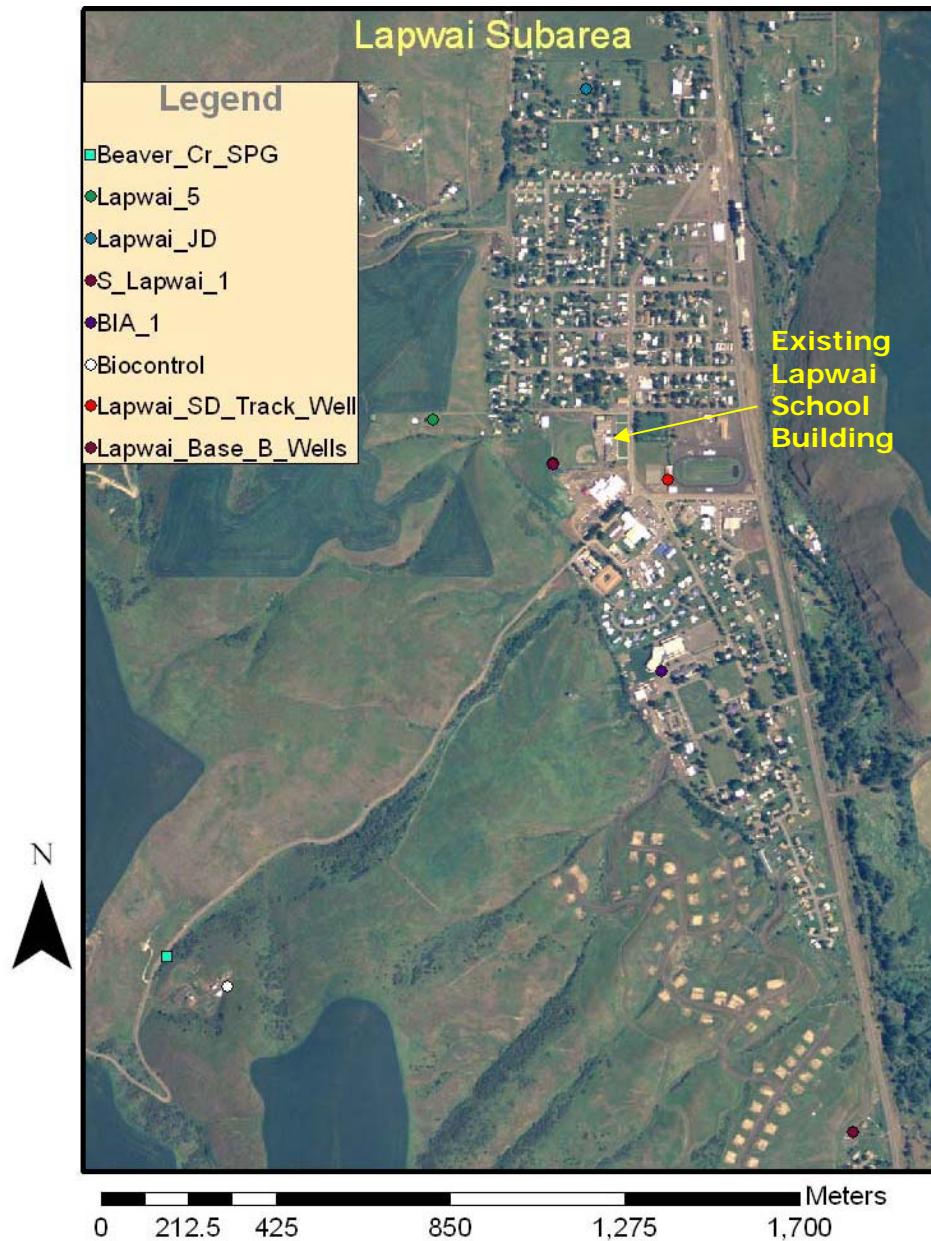
Figure 1. Well locations in the vicinity of the Lapwai Middle-High School (modified from Brackney, 2006).

The use of an isolation heat exchanger also allows for energy-efficient control of the well pump. The building loop temperature is allowed to “float” between a heating and cooling setpoint, and when the building loop temperature reaches either of these setpoints, the well pump is energized and moderates the building loop temperature. With this type of control, the required groundwater