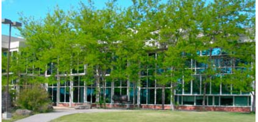
Figure 3. Deciduous trees planted at Purvine Hall reduce solar gain during the Summer, but allow for solar gain in the Winter (Mayer/Reed, 2007, p. 23).