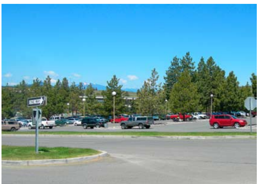
Figure 4. Heat island effect could be mitigated by additional tree plantings (Mayer/Reed Landscape Architects, 2007, p. 23).