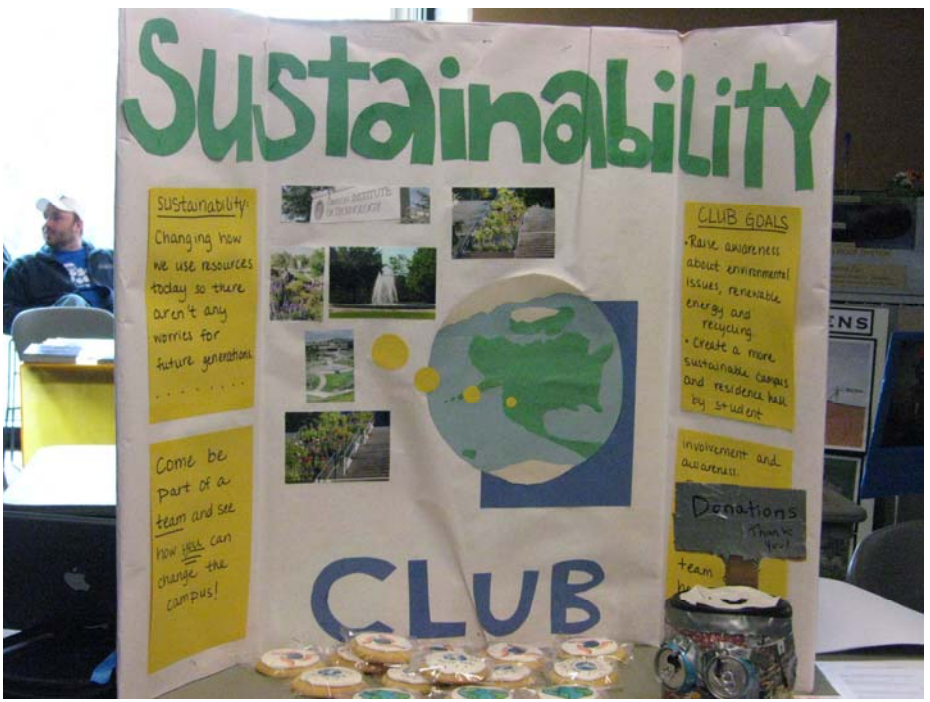
Figure 1. Earth Day presentation by the Student Sustainability Club, Spring 2008.