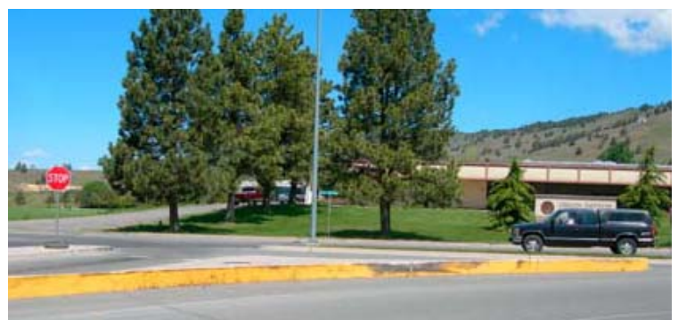
Figure 5. Corner of Campus Drive and Dan Obrien Way that could be improved for pedestrian circulation (Mayer/Reed Landscape Architects, 2007).