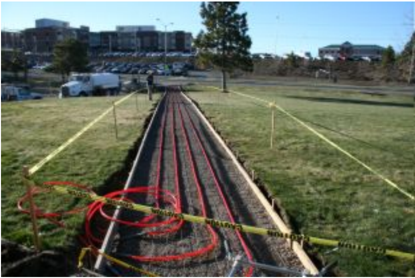
Figure 2. Seismic testing for the deep geothermal well in Spring 2008.