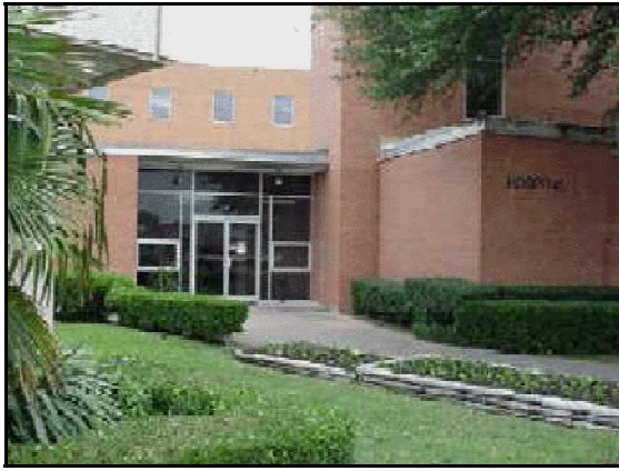
Falls Community Hospital in Marlin (Photo: Falls Community Hospital).

Geothermal water and heat are used in other parts of Texas as well. “An oasis nestled deep in the Chinati Mountains of West Texas,” the Chinati Hot Springs resort located 50 miles southeast of Marfa opened its doors in 1935. The resort offers guests three indoor private baths, two rooms with private outdoor baths, a group hot tub, rustic adobe cabins, guest rooms attached to the main house, campsites, and “all the sweet-tasting spring water you can drink.” Run by a husband and wife team, about 2,000 people visit the Chinati Hot Springs each year.