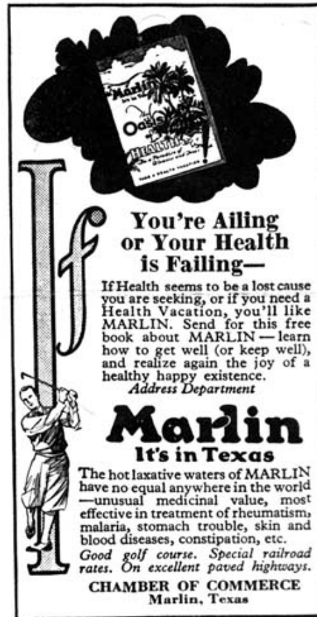
Brochure advertising the health benefits of Marlin’s mineral water

In 1903, Marlin built the Hot Springs Pavilion at the site of the first hot artesian well. The Marlin Chamber of Commerce currently runs the open-air pavilion which contains a four-spout fountain with constantly running thermal water. The fountain is a popular site for resting tired feet, and filling water jugs with spring water to drink.