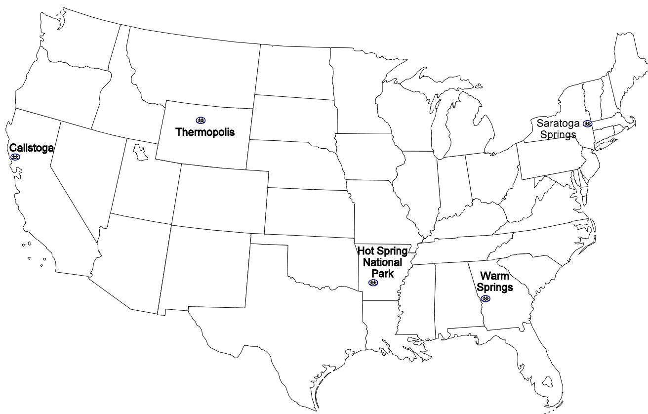
Figure 1. Location of geothermal spas described in the text.

Saratoga Springs, New York , located 250 km north of New York City, had approximately 18 springs and hot wells discharging 13°C carbonated mineral water along a fault. The Mohawk and Iroquois Indian tribes frequented the springs during hunting trips in the area. The first written report of the springs by European settlers was in the early 1600s (Swanner, 1988). Since this time, the springs have been used for drinking and bathing, to cure everything from skin disorders to digestive problems. The water and carbon dioxide has also been bottled and sold as a commercial product. Because of use and decline in flow in the springs in the early 1900s, the state of New York formed Saratoga Spa State Park, and now manages the geothermal activity including the only spouting geyser east of the Mississippi River. Several of the older bathhouses, Lincoln and Roosevelt, have been restored providing mineral baths, hot packs and massages. Two commercially bottled water are available: Saratoga Mineral Water and Excelsior Spring Water. The present Saratoga Spa Park has 10 springs with seven other springs located in the surrounding areas of the city.