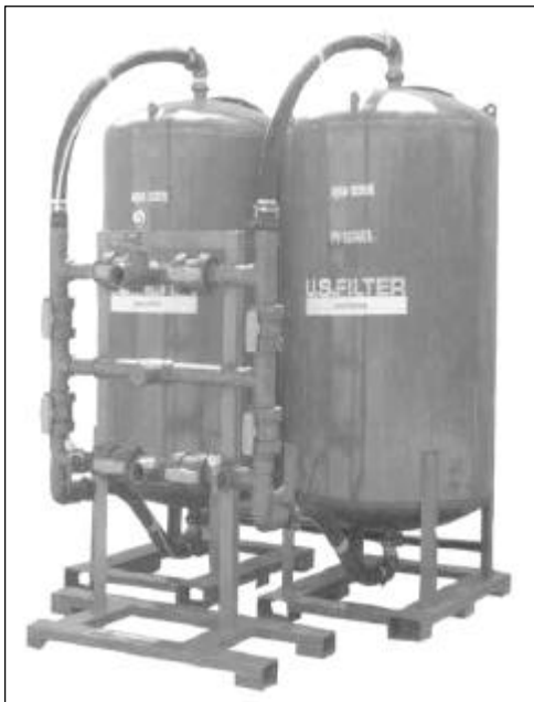
Figure 5. Activated carbon filter.

All agreed, except for the USFWS, that our small discharge and extraordinary mitigation measures were no measurable threat to the Pit River or to the creatures that populate it. It was also unfortunate that I'SOT had to agree to $5,000 more effluent monitoring in the first six months of operation in order for the USFWS not to contest our discharge permit. The U.S. Environmental Protection Agency (USEPA) wrote a letter stating that the effluent monitoring for our project was excessive and recommended reduction after the first year.