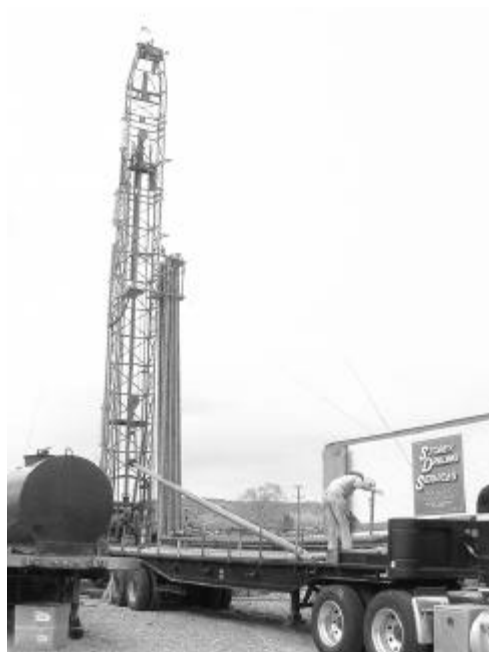
Figure 3. Drilling the well.

After casing the well to 1600 feet, drilling resumed and within a week we were at a depth of 1950 feet and still in the soft tuff. Another temperature log revealed a temperature of 208EF. It was getting hotter, but still we had no water. The I'SOT hydrologist was encouraged because the cuttings were beginning to be lithified from the heat and began to look like the cuttings of another geothermal well in Alturas that was successful. Another decision was made to borrow more money and drill until we got a resource.