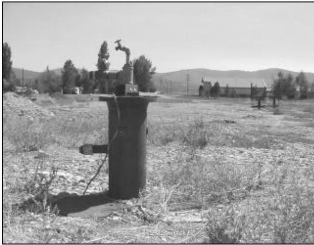
Figure 4. The wellhead.