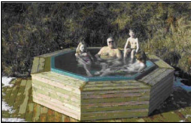
Figure 4. "Heitur pottur" Spa-pool.

Considering the investment people and organizations have made in their holiday homes it does not come as a surprise that the majority of the owners wants to increase the utilization period of the houses. The houses must be inhabitable despite the climate and fully equipped with all modern appliances to provide the comfort and leisure. The best way to increase the utilization is to plug the holiday homes into a district heating system. Heat the houses all year round and the possibility to install a spa-pool (Icelandic: "heitur pottur"), which has a huge attraction for all generations.