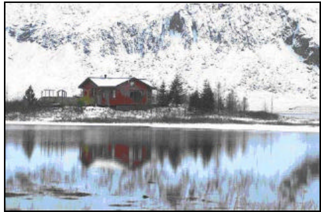
Figure 2. Holiday home at an unique location

The holiday home gives shelter from the harsh and rather unpredictable Icelandic climate. Typically the main occupancy is during the summer time. But summer time in Iceland is quite different from the typical European summer climate, as all sorts of weather can be expected.