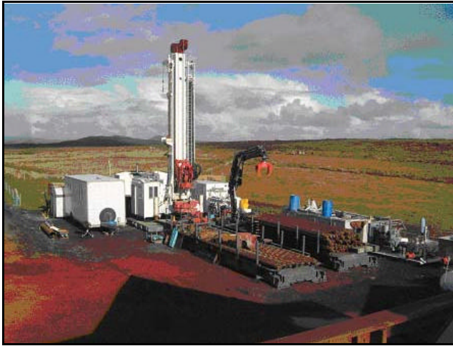
Figure 5. Dilling rig "Saga" at location in Grímsnes.

The full capacity of the field is unknown but the above-mentioned boreholes can supply a total of 1200 holiday homes with sufficient hot water.