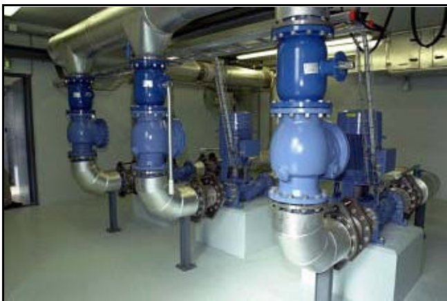
Figure 6. Inside the main pumping station.

The supply temperature measured at the holiday homes ranges from 55 to 80°C, depending on the distance from the geothermal field and the number of connected holiday homes in the vicinity. The supply pressure varies from 2 to 6 bar.