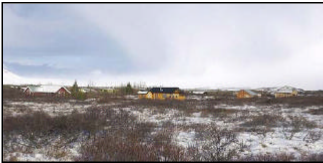
Figure 1. Group of holiday homes.

In Iceland most of the traditional market for district heating services has been covered. Most of the cities, towns and villages that are close to geothermal energy utilise it for space heating. Reykjavik Energy however has taken the initiative and began looking at different market areas for district heating, namely holiday homes, normally located in the countryside. The demand for district heating in holiday home areas has caught us at Reykjavik Energy by a surprise. District heating is a commodity celebrated by many holiday homeowners.