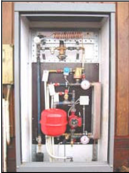
Figure 7. Geothermal connections in a country home cabinet.

the potential customers hooked up within a year from its commissioning. It was, in most cases, far cheaper to use geothermal district heating service than electricity or oil. The encouragement to connect holiday homes to district heating is not only about money; it is about increasing the comfort levels and it enables extended utilisation of the holiday homes all year round.