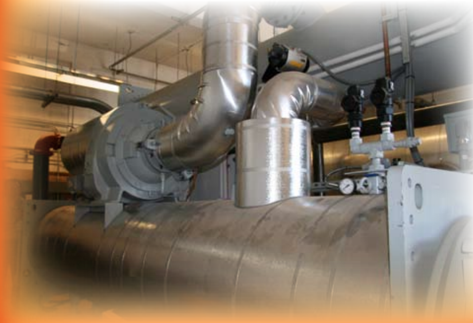
OIT CAMPUS DEVELOPMENT