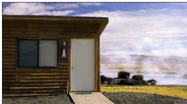
Figure 13. Crystal Crane Hot Springs near Crane, Oregon.

The USGS has identified two KGRAs: Newberry Crater and Burns Butte. The only sizeable communities in this area are Bend and Burns.