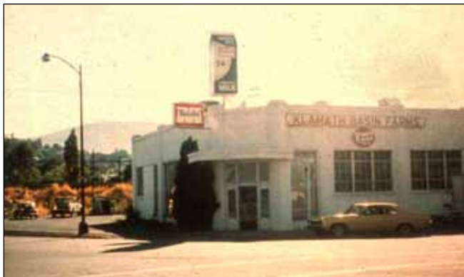
Figure 10. Photo of the Medo-Bel Creamery in the 1970s.

Company building, remnants of which still stand today. The Medo-Bel Creamery (formerly the Lost River Dairy) used geothermal energy for space heating and milk pasteurization.