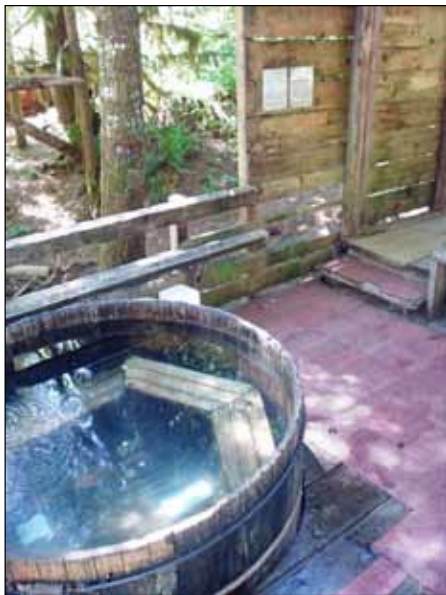
Figure 3. Cedar soaking tub at Bagby Hot Springs.