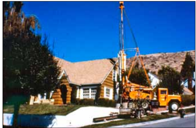
Figure 7. Drilling and installing a downhole heat exchanger at a residence in Klamath Falls.

Today, approximately 550 individual residences in Klamath Falls take advantage of geothermal energy for home space and domestic hot water heating via individual wells drilled to depths ranging from 200 to over 1000 ft, with average depths on the order of 350 ft. A handful of applications are “mini-district systems”, with two or more homes sharing a single well. These wells extract geothermal energy with closed-loop downhole heat exchangers, with no groundwater removal from the well. At 2011 natural gas prices, Klamath Falls residents who use geothermal energy for home heating save an estimated combined $1.5 million per year in energy costs. These geothermal wells have periodic maintenance costs on average every 10 years, where the downhole heat exchanger may need replacing or sediment buildup in wells may need to be cleaned out.