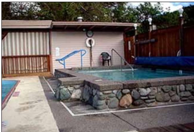
Figure 4. Soaking pool.( www.jacksonwellsprings.com )

Jackson WellSprings is a 30 acre natural hot springs spa and events center located 1.5 miles from the Oregon Shakespeare Festival in Ashland. The facility specializes in mineral springs, swimming, hot water soaking and massage therapy. For centuries, Native Americans have honored the warm springs on the banks of Bear Creek as a sacred ceremonial site. It is reported that warring nations put down their weapons in the vicinity of the hot springs. Applying for water rights in 1862, Eugenia Jackson dedicated the artesian waters to “sanitarium and natatorium purposes”, and this is the mission of Jackson WellSprings. The naturally warm, spring-fed pools provide year around family swimming and soaking. A spacious warm water soaking pool is situated next to WellSprings nearly-Olympic sized swimming pool.