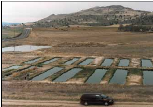
Figure 11. Photo of aquaculture ponds near Liskey Ranch.