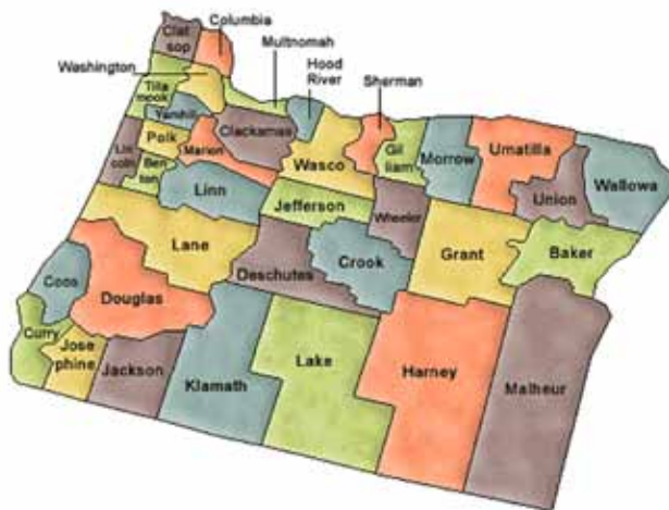
Figure 2. Map of Oregon Counties.

comprised of volcanoes such as Mount Hood, Mount Jefferson, and the Three Sisters (North, Middle, and South Sister). Another High Cascade peak, Mount Mazama, was destroyed about 6,800 years ago by a catastrophic eruption that left a deep caldera later filled by what is now Crater Lake. Mount Hood has been classified as a KGRA by the United States Geological Survey (USGS).