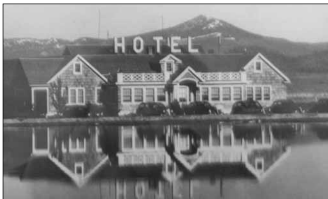
Figure 12. Hunter's Hot Springs Hotel in Lakeview.

Solar Power System binary generators were installed in the Hammersly Canyon area north of Lakeview, operating with 212°F water, which was later augmented with three 300 kW Ormat binary generators in April 1983. PP&L again contracted to purchase the power to demonstrate plant technical feasibility starting in March 1984, but no significant operation ever took place, mostly as a result of difficulties in securing a long term power sales agreement, cooling operation, and interference with nearby wells (Sifford, 2010). While this plant only operated for about 12 months, it represented a milestone in geothermal power generation in Oregon that was not surpassed until over 25 years later, when the first permanent geothermal power plant was installed on OIT's campus in 2010.