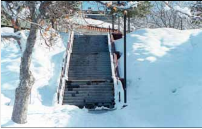
Figure 8. Geothermally snow-melted stairs at the OIT Campus in Klamath Falls, Oregon.

geothermal combined heat and power. The plant generates about 1,750 MWh net electrical energy per year, saving the OIT over $100,000 annually. It is interesting to note that the geothermal power plant produces more than enough electricity to offset well pumping energy for the campus geothermal heating system, making the use of geothermal energy for campus heating 100% renewable.