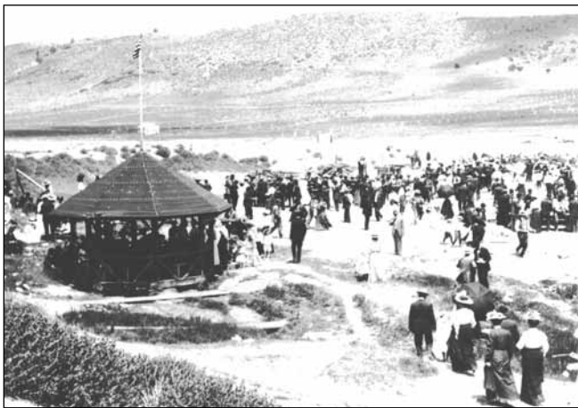
Figure 6. Big Springs in early 1900s.

Historically, Native Americans used the hot springs located within the present Klamath Falls City limits for about 10,000 years. These springs were used to cook game and to heal various ailments. The most famous of these springs were “Big Springs” located in the present Klamath Union High School athletic field, and “Devils Tea Kettle” located near the present Ponderosa Middle School athletic field. “Big Springs” was used by the European settlers during the early 1900s for cooking and scalding meat, cooking vegetables, bathing, and just to keep warm (Lund, 1978).