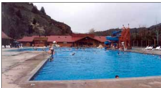
Figure 14. Kah-Nee-Ta swimming pool.

Kah-Nee-Ta High Desert Resort & Casino is located on the eastern flank of the Cascades, at the beginning of the high desert region of Central Oregon, just two hours from Portland and an hour and a half from Bend. The Kah-Nee-Ta swimming pool is located on the 600,000-acre Confederated Tribes of Warm Spring Reservation, formed in 1879 and settled by Paiutes, Warm Springs and Wasco tribes. The swimming pool is located adjacent to the Warm Springs River, a tributary of the Deschutes River. The resort was started in the early 1960s, and in addition to the swimming pool includes a lodge, an RV village with condos and tepees, and a gambling casino (Lund, 2004). Warm Springs in this area have been used by the local Indians for centuries, and today, produce about 400 gallons of water per minute at 128°F and are used to heat the swimming pool. None of the other facilities on the resort/casino area are heated by geothermal energy due to the distance and limitation on the flow rate from the springs (Lund, 2004).