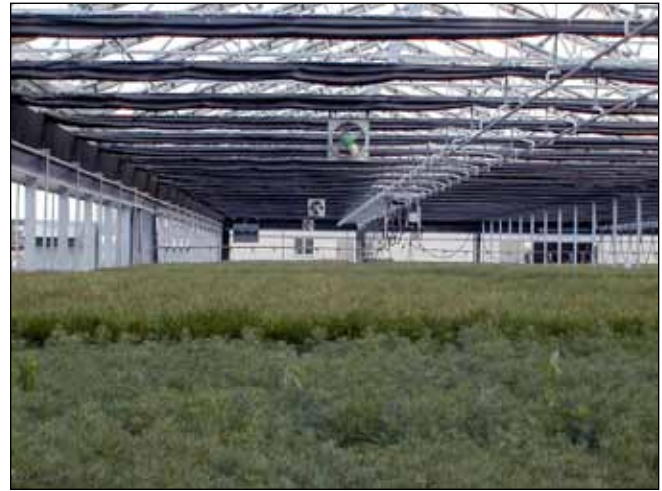
Figure 9. Tree seedlings grown in IFA greenhouses heated by the Klamath Falls district geothermal heating system.

Six Klamath Falls schools (Klamath Union High (location of Big Springs), Mazama High School, Roosevelt Elementary, Ponderosa Jr. High, Mills Elementary and Klamath Institute) use geothermal energy for space heating, hot water generating, and some snow melting. Lund and Lund (2010) describe geothermal energy use at three of these schools in detail. Ponderosa Middle School boasts the largest capacity downhole exchanger system in Klamath Falls. At 2011 natural gas prices, the City of Klamath Falls schools save about $300,000 per year in energy costs.