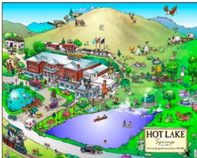
Figure 15. Hot Lake poster

La Grande has warm water within its city limits. Hot Lake, about 10 miles east of La Grande, has an interesting geological, pioneer, and medicinal history. The 2½ million gallons of hot 186°F water that flow out of the ground every day have always been a natural attraction for travelers in the Grand Ronde Valley. Native American tribes used its “curative powers” and set it aside as a peace ground. The Hot Lake area was used for rest and healing of their sick and wounded, and as a summer rendezvous area. Hot Lake was first seen by European settlers on August 7, 1812. The Wilson Price Hunt expedition was traveling from what is now Astoria, Oregon, to St. Louis, Missouri, and noticed the hot spring. Eagles Hot Lake RV Park offers accommodations for campers and large RVs with a heated pool and spa.