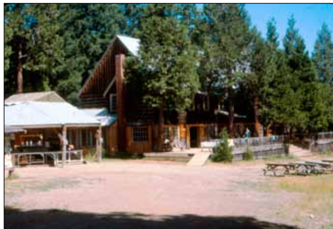
Figure 5. Historic lodge at Breitenbush, which has been operational for over 80 years.

Breitenbush Hot Springs, Retreat and Convention Center is an abundant hot springs that have long been a destination for those seeking healing, rejuvenation and community. Three Meadow Pools are lined with smooth rocks and overlook a river. The four tiled Spiral Tubs are aligned in the cardinal directions with increasing temperatures. They are adjoined by the cedar tub cold plunge. The Sauna is a cedar cabin resting atop the bubbling waters. The cabins are heated year round with heat from the hot springs waters.